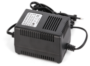
AC24V/3A Power Supply